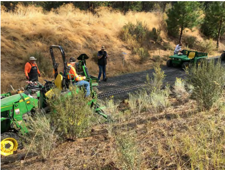
The Idaho mafia track crew working on the track

(Above and below) Work on the Panama Canal drainage project