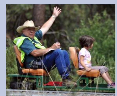
The Next Generation!