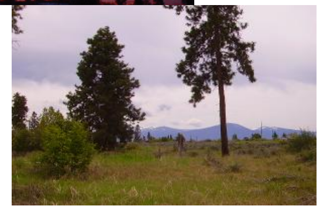
Lot 4 Kerry Drive

Beautiful view of the Sprague River from updated remodeled two bedroom, two bath 1989 manufactured home (936 sq. ft.) together with a detached 18'x 20' metal garage, 10'x 13' garden shed and 6'x8' well house on 5.74 private acres bordered by U.S. land. Near Chiloquin. $149,500. HM-804/64435