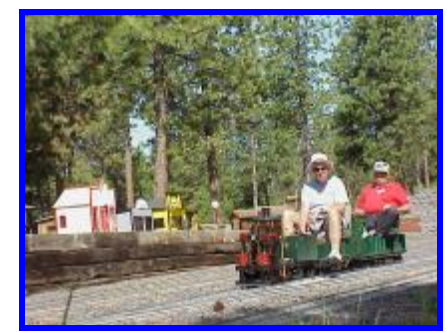
Big trains, small trains, steamers, diesels, it just doesn't matter at Train Mountain, come and have some fun in the sun!

Lots of activity on the Ellingson Turntable with several steamers quartered there.