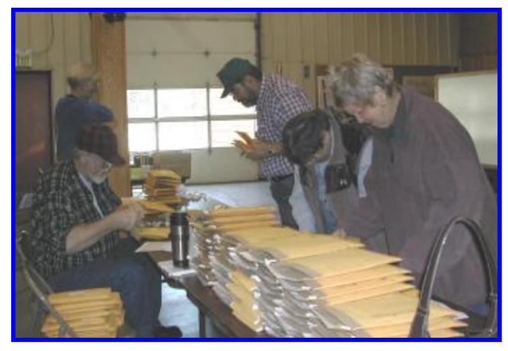
The 'stuffing' crew hard at work. Un-touched by human hands—just volunteers!

Just look, there's plenty of free parking! No lines at the turntable! And 30 miles of tree lined right of way!