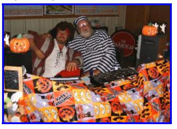
Pirates of the Chiloquin and the boy's later in the evening