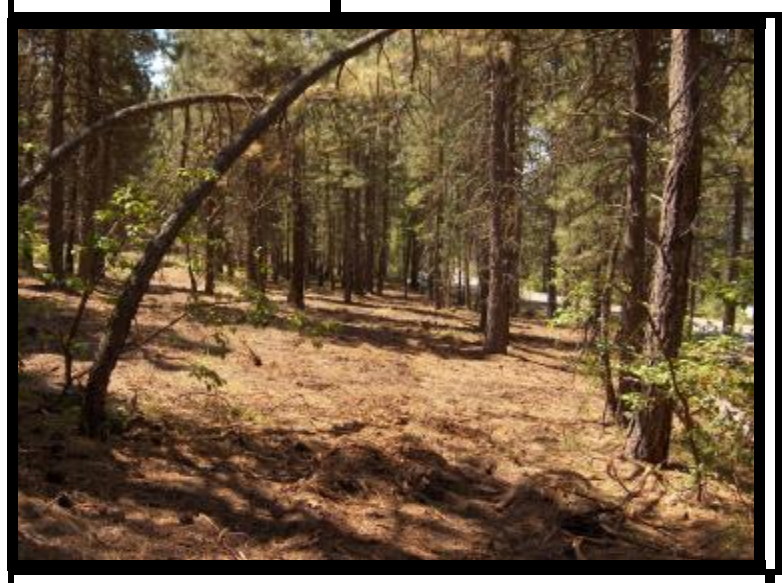
T.M. Member's chosen view of UP/BNSF shared mainline track. 3 lot parcel sits 1/2 way between the two whistled crossings i.e.; a 1/2 mile from each. Two home sites approved & room for shop!! Nice rolling hillside in pines & aspens for privacy. Great potential for a unique home(s). Now asking $63,000 for 3.3 Ac. #AS-727/61947