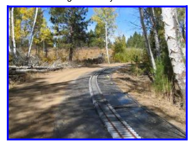
Yard area at Sheep Station