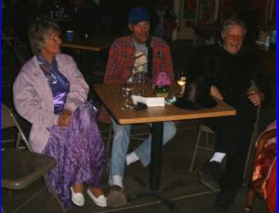
They let me out in time for the party, along with some more of the 'locals'!