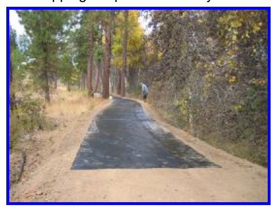
Laying out the plastic