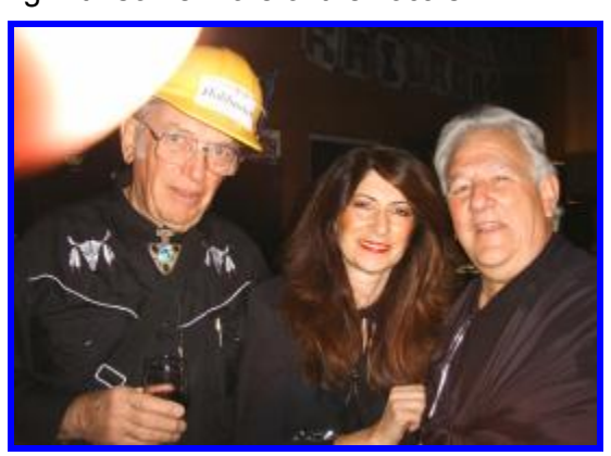
The hostesses and the movers and shakers.