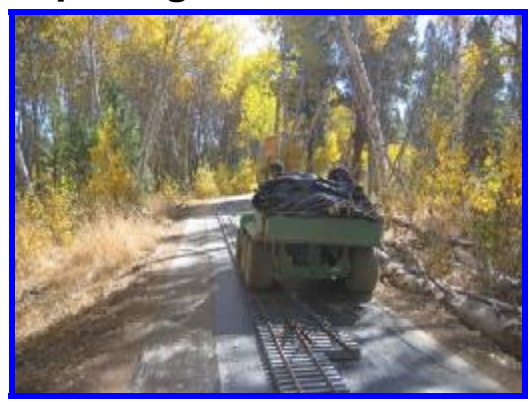
Taking the Plastic out to Aspen Grove Loop