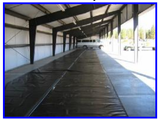
Prepping the plastic underlayment