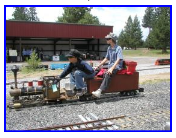
I don't know about the adults but the kids sure were having a good time running trains at the Triennial (and they did a great job of it too!).