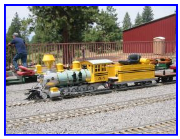
Some of interesting things at the triennial are all the innovative new products on display. The steam locomotive shown here is actually battery powered!