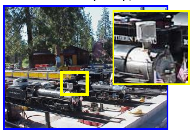
Spark arrestors were used during the Triennial and here is a good example. Unless you want to spend some of your valuable Train Mountain time building one, you might want to build yours at home and bring it with you.