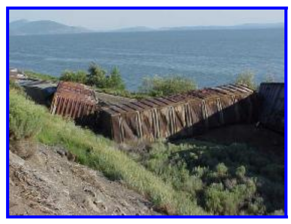
The previous picture was the middle of the errant train while the picture above was caused by a couple of helpers at the rear that helped a little to much.