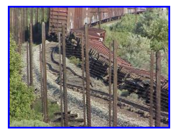
In case you hadn't heard the big boys dumped a train just south of Chiloquin at Modoc Point. 35 cars rolled off the track and created quite a mess.