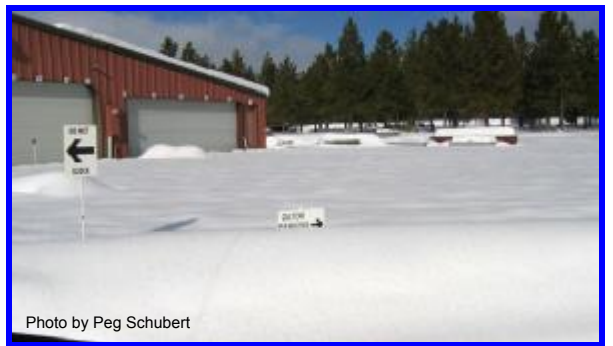
But if you park here, you may never be seen again