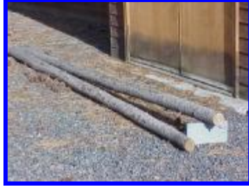
You start with some bunk houses, a couple of spar poles,