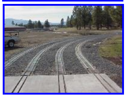
(Continued on page 3)