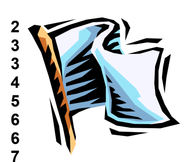
(Continued on page 2)

From The Manager Triennial Preparations Next Work Week What Works Prototype Rules of the Road Operations For the Ladies