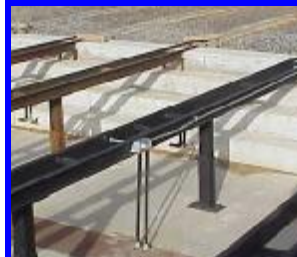
(Continued on page 4)