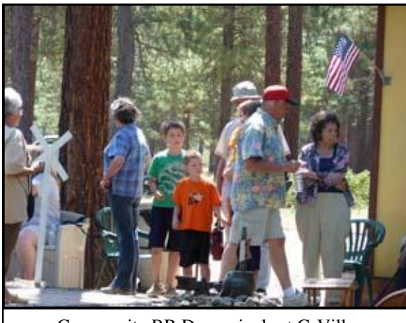
Community RR Day arrivals at G-Ville

Again, it's a wonderful job and we get to do it. Say thank you, that is, although thank you is not enough for all the thoughtful help and donations we've received, so please know we feel much more gratitude for these random acts of kindness than these words express.