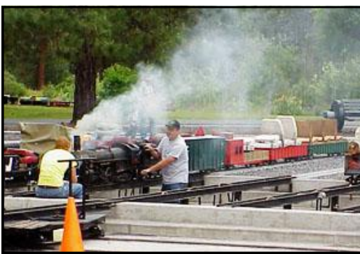
Lots of steam engines at the Ops Meet—even with the north side closed!